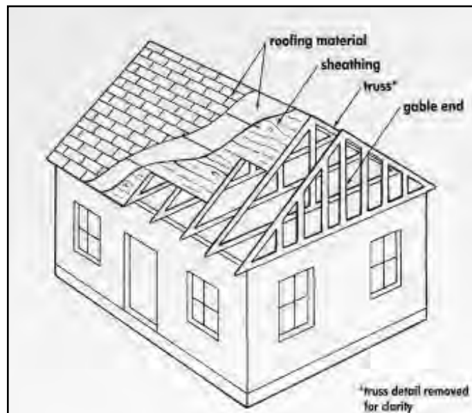
Make sure roof sheathing is properly installed.

Roof sheathing (the boards or plywood nailed to the roof rafters or trusses) can fail during a hurricane if not properly installed. Examine the sheathing from the attic. If many of the nails have missed the rafters, you may need to re nail the sheathing. If you're putting on a new roof, make sure the sheathing complies with current recommended practices.