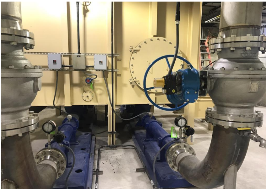
Pressure gage readings during operation of the Inland Bays sludge transfer pump station November 2020.