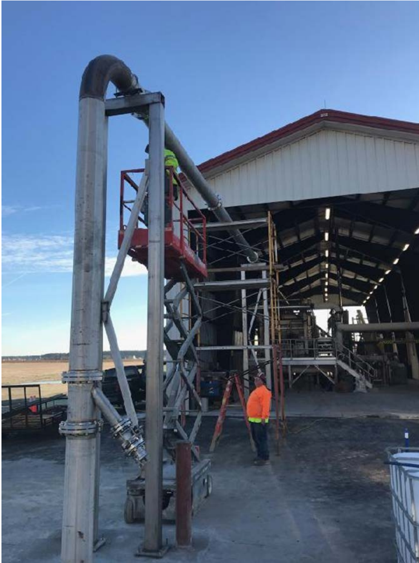
New above ground direct feed stainless steel sludge piping.